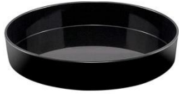
9" to 11" Ikebana bowl

A round shallow container about 10 to 12 inches in diameter. Here are three samples: