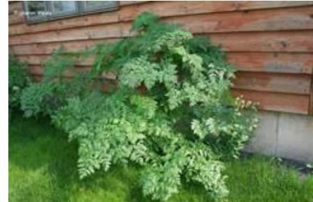
Figure 13 Poison hemlock, first year plant (photo S Yiesla)

The Plant Clinic has already received several reports of poison hemlock ( Conium maculatum ). This weed has been fairly prominent for the last few years, not only in home gardens, but popping up along the side of the road in many areas. Poison hemlock (fig. 13) is a member of the carrot family (which contains both edible and toxic plants, so beware!!). Most members of this family have the same type of umbrella-shaped flower cluster known as an umbel. Because the flower cluster of Queen Anne's lace and the flower cluster of poison hemlock look similar, plants may be incorrectly identified. This can lead to contact with a dangerous plant.