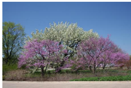
Figure 17 Spring flowering trees like redbud will also serve pollinators

Spring flowering trees, like redbud (fig. 17), serviceberry and crabapple are also a good choice and some of these may already be in your yard. Even non-native flowering plants like crocus, hyacinth, bleeding heart and hellebores will serve pollinators well. Remember that many non-native plants are well behaved and are not invasive.