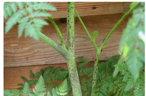
Figure 14 Spotted stem of poison hemlock

Poison hemlock is a large, non-native plant, often six to ten feet tall. The smooth stem is stout, has a ridged appearance, and is marked with purple spots (fig. 14). The stem is hollow. Leaves are large and very ferny in appearance (fig. 15). Poison hemlock is a biennial plant, which means it will form foliage in the first year and flower and set seed in the second year. Plants in their second year will have the typical white flower cluster (umbel) of the carrot family. Queen Anne's lace has one red floret in the center of its flower cluster while poison hemlock does not.