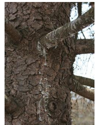
Figure 11 Sap flow due to Cytospora canker

We continue to see a lot of dieback on spruces, as we have for the past several years. One source of this dieback is Cytospora canker. This fungal disease is common on stressed spruces. Cytospora canker is more common on trees that are older than 15 years, because younger trees are more vigorous. Because we have been having so much environmental stress (drought, flooding, etc.), this disease has become very prevalent in the landscape. The disease usually starts on the lower branches of the tree and progresses upwards. Needles turn brown and finally drop, leaving dry, brittle twigs and branches. The fungus often enters the tree through wounds, but on trees that are highly stressed, the pathogen may enter through natural openings. Cankers develop under the bark. A thin coating of white resin (fig. 11) is generally found on infected twigs and trunks.