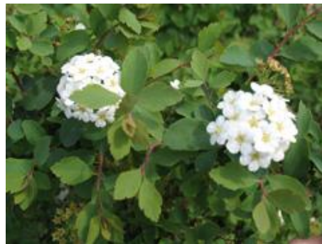
Figure 1 Bridalwreath spirea