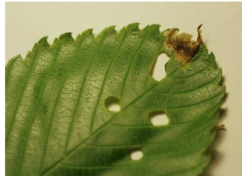
Figure 2 Adult elm flea weevil damage (holes) and larval damage (blotch mine)

One of our scouts has found feeding damage from elm flea weevil ( Orchestes steppensis ) on elm leaves. The weevils overwinter as adults and have now come out to feed and lay eggs. Adult-feeding results in tiny shot holes in the leaves, and heavy feeding can cause newly expanding leaves to wither and turn brown. After feeding, the female weevil cuts a cavity into the leaf mid-vein and inserts an egg. The hatching larvae create blotch-shaped mines (fig. 2) at the leaf tips. Larvae feed for about 2-3 weeks, and then pupate within the mined leaf. Very heavy feeding can reduce photosynthetic capacity of the tree, thereby impacting overall tree vitality.