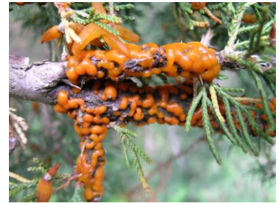
Figure 10 Cedar-quince rust

Management is usually more focused on the hosts in the rose family. The best management is to plant resistant varieties of crabapples and hawthorns. Remember, resistance is not the same thing as immunity. Being resistant does not mean that the tree will never get rust. It only means that, in an average year, it is less likely for the disease to develop on the host. In a year that is very favorable to the fungus, even resistant trees may show some signs of disease. When considering the purchase of a new crabapple, check with your local nursery about which rust-resistant cultivars they offer. Chemical control for rose family hosts, if used, needs to start as leaves are emerging and when the telial horns are expanding on junipers. Although the rust diseases will cause orange spots on leaves and infect fruit, actual long-term damage is mostly minor, and may not require treatment. Cedar-quince rust can lead to stem swelling on hawthorn, and those swellings can lead to dieback on infected twig tips. Dead branch tips should be pruned out.