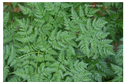
Figure 15 Leaves of poison hemlock

Management: Plants can be cut down or dug out. This should be done before the plants go to seed and is most easily done when plants are small. Cover your skin during this process. In spring, small, actively growing plants may be treated with a non-selective herbicide.