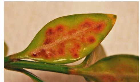
Figure 4 Spots caused by boxwood leafminers

Boxwood leafminer ( Monarthropalpus flavus ) has been a big problem for the last few years, with large populations evident on many boxwoods. They overwinter, as larvae, in the leaves on boxwood. Look for 'blisters' (fig. 4) on the leaves that turn from light green to orange or brown (as the larvae mature). The larvae are inside these blisters. Look carefully, as these blisters are sometimes mistaken for fungal leaf spots. The larva will pupate inside the leaf and emerge as an adult around GDD 50 450. When the adults emerge, they will be orange and have a mosquito-like appearance.