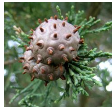
Figure 8 Cedar-apple rust gall with spore horns emerging

The cedar-rust diseases are starting to be active on the evergreen host (juniper). We have already seen a small infection of cedar-quince rust on juniper. There are three main rusts on juniper: cedar-apple, cedar-hawthorn, and cedar-quince. Cedar-apple rust and cedar-hawthorn rust both form golf ball-shaped galls (fig. 8) on junipers. During spring rains, the gelatinous telial horns (fig. 9) expand from the golf ball-like galls. Spores are released from the horns and are blown to a host in the rose family, e.g., apples, crabapples, and hawthorns. Orange leaf spots subsequently develop on the rose family plants during the summer.