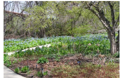
Figure 16 A garden with spring wildflowers may serve pollinators better than an unmown lawn

There is a simple and positive way to help pollinators in spring (and through the rest of the growing season). Plant more flowers in our gardens! (fig. 16) Any plant that has a showy, colorful flower will serve pollinators. We may just need to put a little more effort to plant some of the plants that will flower in the early part of the season. There are actually a lot of choices. Spring wildflowers like Virginia bluebells, Dutchman's breeches, spring beauty and toothwort fill our woodlands with flowers in spring. The woods are also filled with pollinators looking for those flowers. Plant some of these wildflowers in your yard and the pollinators will find them.