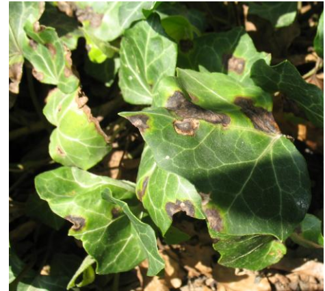
Figure 7 Bacterial leaf spot on English ivy

Reports of disease have been scattered so far, but here are problems to look for. On pachysandra, Volutella blight is possible. This will cause brown leaf spots which contain concentric circles. Dark stem cankers are also possible.