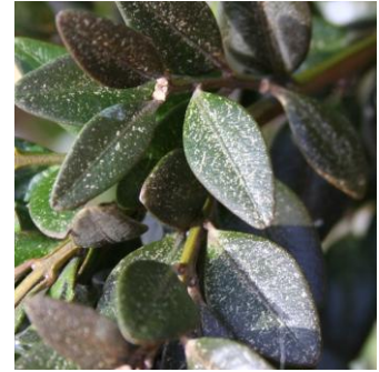
Figure 5 Boxwood mite damage

Management: Mite populations can be reduced by washing the plant off with a strong stream of water from the garden hose. Be sure to wash off the lower side of the leaves. High populations may need to be treated with a miticide/insecticide.