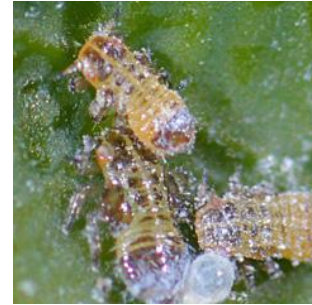
Figure 3 Boxwood psyllid nymphs

Boxwood psyllids ( Cacopsylla buxi ) should be active by now. The psyllids overwinter as tiny orange eggs in the bud scales of the boxwood. As the buds open, the psyllids hatch and begin to feed. The nymphs (fig. 3) are about 1/16th of an inch long, yellowish, and partially covered with a white secretion that protects them from parasitoids and chemical sprays. Their feeding causes cupping of the leaves. If your boxwood had this pest last year, the foliage from last year will show cupping. Newly hatched psyllids will cause cupping on new leaves.