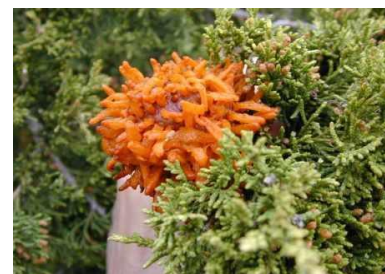
Figure 9 Jelly like spore horns

Cedar-quince rust is a bit different. Of the three cedar rust diseases, cedar-quince rust can cause the most damage by infecting fruits and twigs on trees in the rose family, especially hawthorns and serviceberries. Although cedar-quince rust spends part of its life cycle on junipers similar to cedar-apple rust and cedar-hawthorn rust, it does not form galls on the junipers. Cedar-quince rust appears as orange ooze (fig. 10) that seems to be leaking directly from the twigs and branches of junipers. We have seen one sample of cedar-quince rust starting to sporulate. It is possible for all three diseases to be present on the same host at one time.