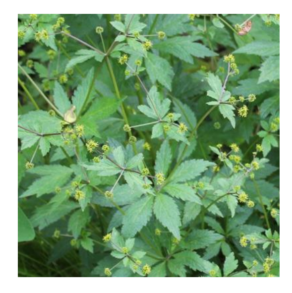
Figure 13 Black snakeroot

Are these plants weeds or wildflowers? This is a decision each person has to make. They are native