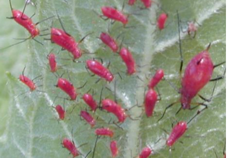
Figure 4 Red aphids