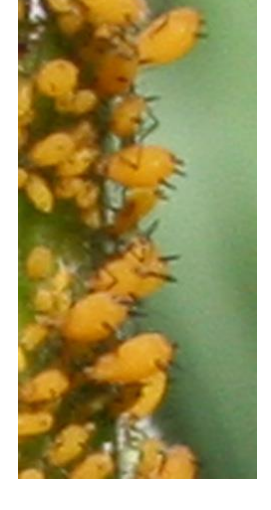
Figure 3 Yellow aphids

https://mortonarb.org/plant-and-protect/tree-plant-care/plant-care-resources/aphids/#!