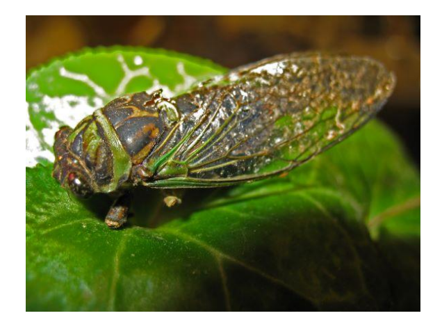
Figure 6 Annual cicada

Contrary to many published reports, this was NOT the year for the periodical cicadas to attack Northern Illinois (that will happen in 2024). It is, however, time for the annual, or dog-day cicadas ( Neotibicen linnei ) to show up. These are the insects that make a lot of noise high in trees during the warm, dog-days of summer. This is the mating call of the male. They are about 1.75 inches long and are green to brown with black markings (fig. 6). A distinguishing factor between the annual and periodic cicada is the eye color.