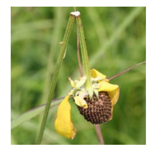
Figure 2 Damage from head-clipping weevil

Once the flower head finally breaks off and falls to the