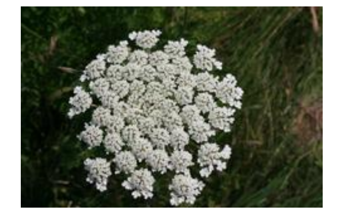
Figure 1 Queen Anne's lace