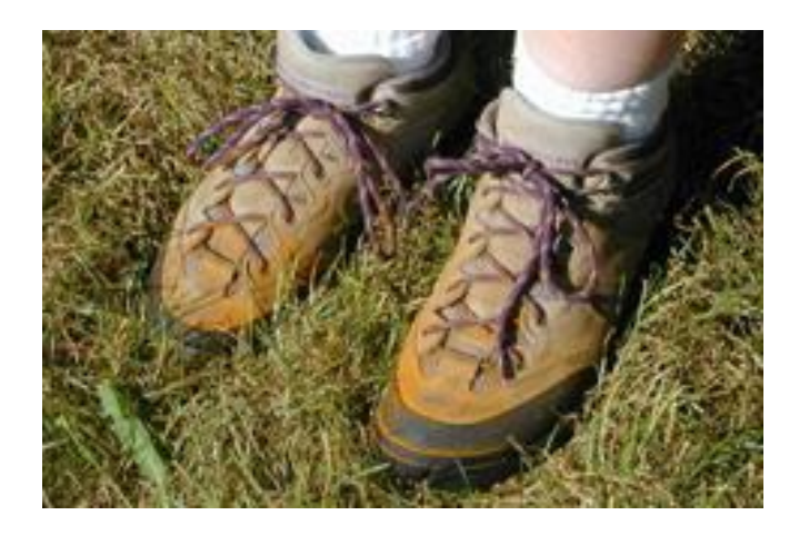
Figure 11 Orange rust spores on shoes

It is strange that we are most of the way through July and no one has reported rust on their lawn. Someone out there has orange shoes and is not telling me! This disease generally shows up in July and August when the grass slows its growth due to heat and dryness. The slow growth of the turf allows the disease to attack the grass. Lawn rust is caused by a Puccinia sp. All turfgrasses can be infected by many different species of rust fungi, and Kentucky bluegrass is one of the more rust-susceptible grass species.