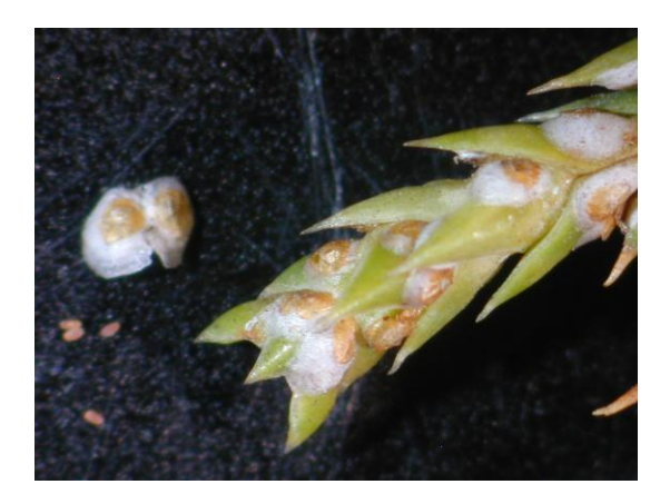
Figure 5 Juniper scale adults (on stem) and crawlers (left side on table)

Adult female scales overwinter on needles. They are circular and white to tan in color. Males are more elongate, white with a yellow 'cap' near one end (fig.