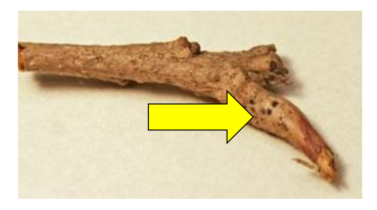
Figure 10 Black pustules on leaf stalk

located on the petioles (fig. 10) of these infected leaves (the main part of the leaf may fall, but the petiole often remains attached to the tree). The presence of these pustules is considered a requirement for the confirmation of BOB. New spores will be released in spring. Repeated years of defoliation may predispose the tree to other problems, such as Armillaria root rot and two-lined chestnut borer. Often, these secondary problems contribute to the death of a tree as much as BOB itself.