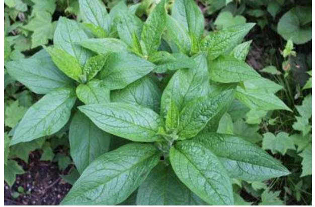
Figure 12 Stickseed

Our first contender is <u>stickseed</u> ( Hackelia virginiana ). We have been aware of this weed for many years. This one is tricky. Early in its growth, it resembles purple coneflower (fig. 12). So, most people assume that their coneflower made seedlings and they stop thinking about it. Then, before they know if, this plant has flowered and made seed pods. The seed pods are small