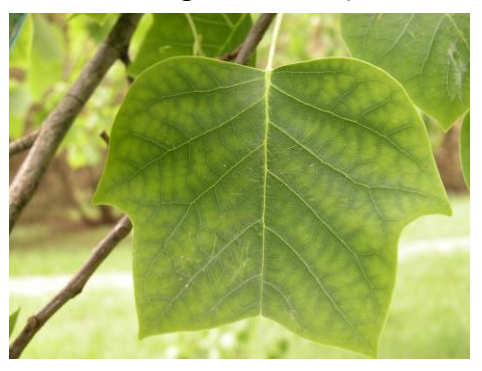
Figure 10 Chlorosis on tuliptree leaf

nigra) and hickory ( Carya spp.) Chlorosis is a yellowing of the leaf due to low levels of chlorophyll (the green pigment in leaves). In mild cases, leaf tissue appears pale green but the veins remain green (Fig 10) Leaf tissue becomes progressively yellow, and may turn white in advanced cases. Leaf margins may become scorched or develop symmetrical brown spots between veins. Trees that commonly show chlorosis include pin oak, red oak, red maple, white oak, river birch, tulip-tree, sweet gum, bald cypress, magnolia, and white pine.