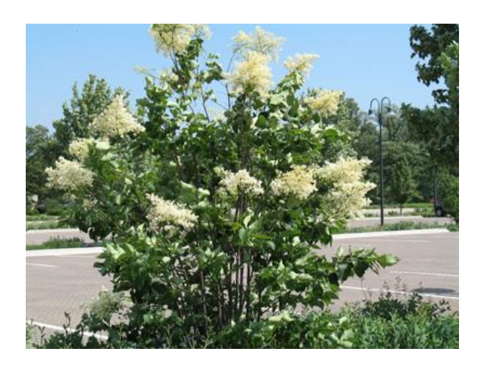
Figure 1 Japanese tree lilac