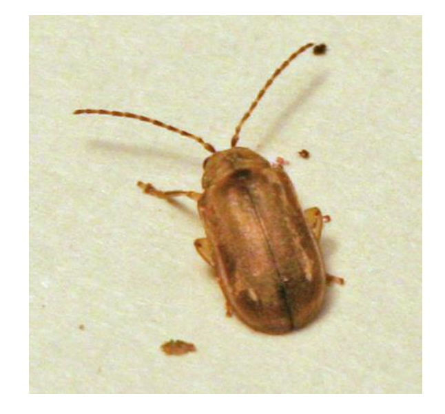
Figure 2 Viburnum leaf beetle adult

In fall, look for egg-laying sites. The actual eggs are not visible. The eggs are laid in small holes on the ends of twigs, and then the holes are capped with a mixture of chewed wood and excrement. The caps are dark and stand out against the bark of the twig, making them easy to see. From October through March, cut out the twig tips that have the eggs in them and get them out of the garden completely. This is the most effective and least toxic means of control. It will greatly reduce the number of insects you have next year. If the eggs can't hatch, they can't eat.