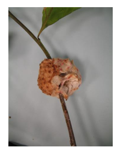
Figure 7 Wool sower gall