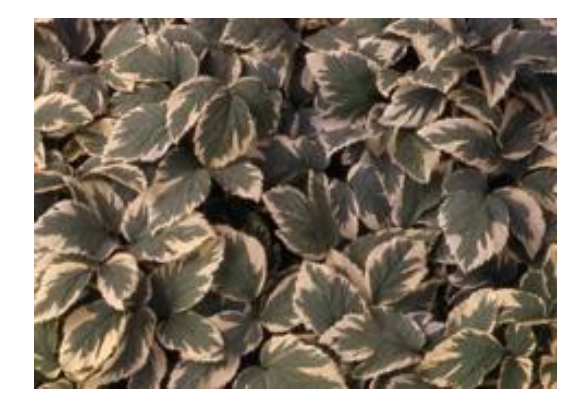
Figure 9 Variegated Bishop's weed

For many years, Bishop's weed ( Aegopodium podagraria ) was sold as a ground cover and some garden centers still sell it. The variegated cultivar (Fig. 9) was especially popular. But times change, and the biggest question that the Plant Clinic gets regarding this plant is "How do I get rid of this?" Why the change? Bishop's weed is a strong grower and is very aggressive, often covering a lot more territory than is desirable. This plant spreads easily underground and can be difficult to control. Wisconsin law designates this as a "restricted