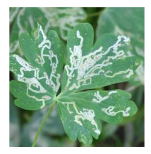
Figure 3 Columbine leafminer damage

https://wimastergardener.org/article/commoncolumbine-pests-columbine-leafminer-and-columbine-sawfly/