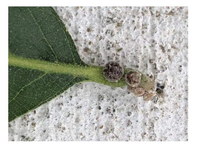
Figure 4 Kermes scale

A couple of years ago, we had an infestation of kermes scale on oak, most commonly on bur oak. There are a couple of species of kermes, and they vary in color. Some species are dark and some are more mottled. We have received a report of Kermes scale on bur oak this season. This species of scale tends to congregate at the ends of the twigs, weakening them. Often the ends of twigs will break off and fall to the ground. The appearance of several twig ends on the ground tends to get the attention of the owner of the tree. (In the case reported to us this year, the