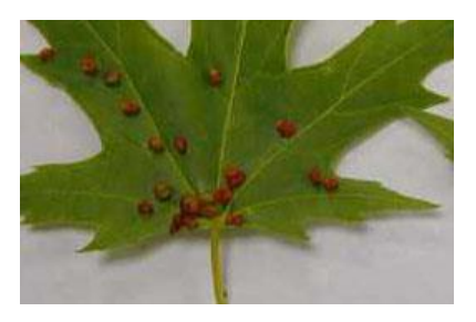
Figure 6 Maple bladder gall

Good website: https://ohioline.osu.edu/factsheet/ENT-60