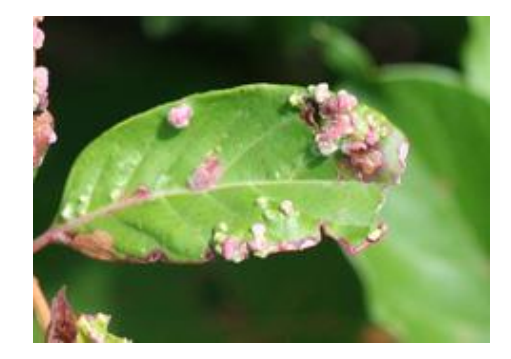
Figure 5 Galls on buttonbush

Our native buttonbush ( Cephalanthus occidentalis ) is showing a weird gall that we have seen in previous years. <u>Buttonbush galls</u>, caused by a mite, are small, bumpy galls (fig. 5). They sometimes show up in large numbers, giving the whole shrub an unattractive look, but doing very little real damage.