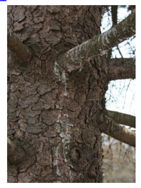
Figure 5 Sap flow due to Cytospora canker

We continue to see a lot of dieback on spruces, as we have for the past several years. One source of this dieback is Cytospora canker. This fungal disease is common on stressed spruces. Cytospora canker rarely affects trees that are younger than 15 to 20 years old, because younger trees are more vigorous. Because we have been having so much environmental stress (drought, flooding, etc.), this disease has become very prevalent in the landscape. The disease usually starts on the lower branches of the tree and progresses upwards. Needles turn brown and finally drop, leaving dry, brittle twigs and branches. The fungus often