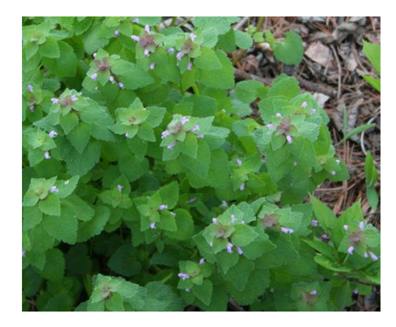
Figure 7 Purple deadnettle

It comes from Europe and Asia, but is long-established here in the U.S. It is a member of the mint family, so it is related to (and often mistaken for) some other aggressive weeds like creeping Charlie and henbit. The