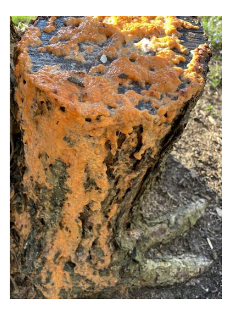
Figure 4 Fusicolla on cut stump

Management: There is no cure for wetwood (or Fusicolla ). Keep trees watered during dry periods because drought is thought to increase wetwood problems. The practice of boring a hole into the trunk and inserting a pipe to release gas pressure doesn't help,