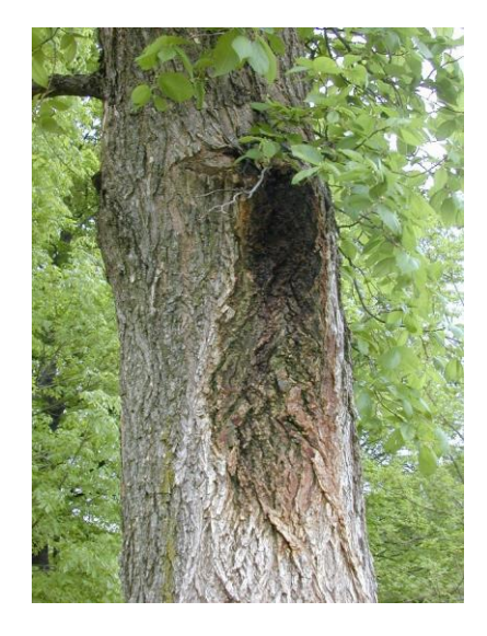
Figure 3 Wetwood/slime flux

We are also getting email regarding a similar problem, but the flux is bright orange (fig. 4). This flux is caused