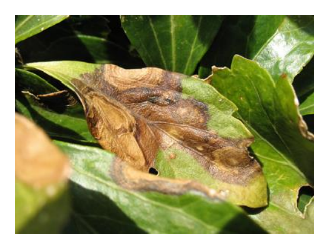
Figure 2 Volutella on pachysandra

Our scouts have been out and found some Volutella blight on Japanese pachysandra ( Pachysandra terminalis ). In most springs, we see this disease right after snow-melt, and the plants tend to outgrow the disease quickly. In the last few years, when we had heavy rains, this disease ran rampant and did a lot of damage to large, established plantings. The infections we are seeing this year, <u>so far</u>, are resulting in small patches of dead plants. It will be worth watching for this disease in pachysandra plantings, since rainfall has been plentiful this year.