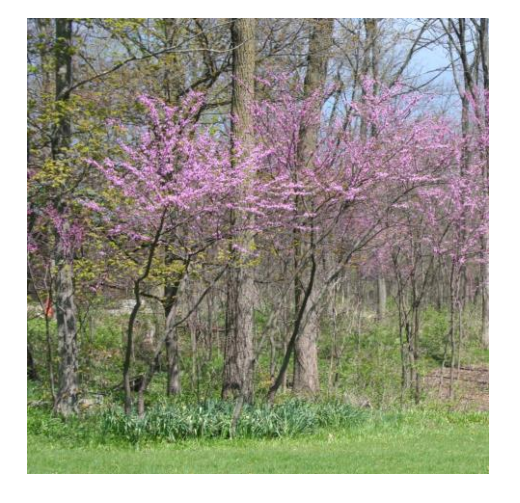
Figure 1 Redbud in flower