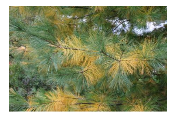
Figure 10 Seasonal needle drop on white pine

needle drop). In autumn, many evergreens will drop older needles. This is a normal process. Needles on an evergreen live for a limited number of years. At the end of their lives, these needles will turn yellow or brown and eventually fall off. On some evergreens, such as white pine or arborvitae, this process can be very dramatic, making the evergreen look like it is dying. To determine if your tree has a disease or is going through normal needle drop, check the location of the yellow or brown needles. Trees going through normal needle drop will have a