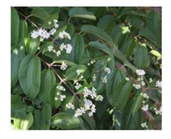
Figure 1 Seven-Sons flower