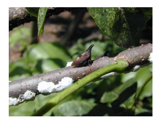
Figure 4 Adult with egg plugs

Good website: https://bygl.osu.edu/node/1388