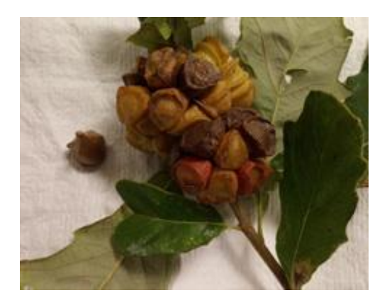
Figure 7 Oak lobed gall

We have seen a lot of galls this summer, and most of them are the ones we see year after year. This year, one of my favorites has shown up in the Plant Clinic email. It is the oak lobed gall, sometimes called the pine cone oak gall (fig. 7). It shows up on oaks and looks a bit like a pine cone. It is often 2 to 3 inches across and goes through some interesting color changes (pinks, reds and browns). This gall is caused by a wasp, Andricus quercusstrobilanus (a cool name for a cool gall). The gall is composed of several wedge-shaped sections.