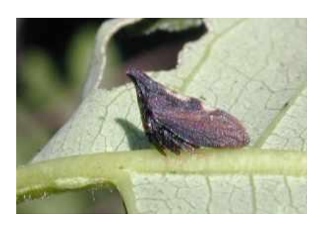
Figure 2 Adult two-marked tree hopper

Evidence of the two-marked treehopper ( Enchenopa species) has been found on redbud ( Cercis canadensis ). Adults are dusky brown with two yellow spots on their backs (fig. 2), thus the name. They have a high, curved horn that points forward coming out of their thorax. The adults are less than ½ inch long. The nymphs look