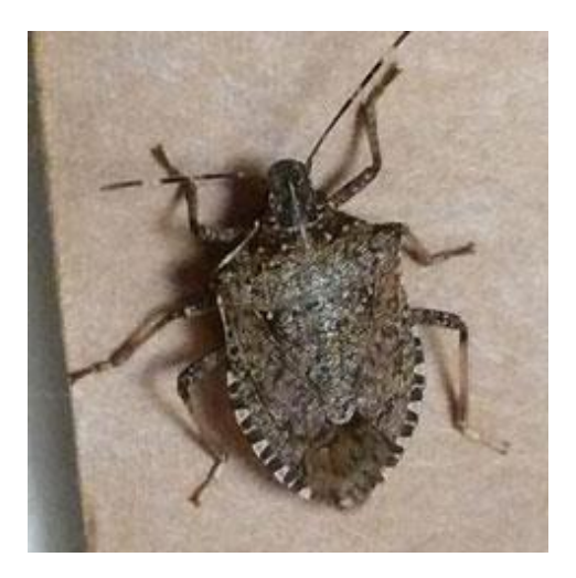
Figure 6 Adult brown marmorated stink bug

Speaking of home invaders: brown marmorated stink bugs (BMSB) are showing up more often now in the Chicago area. These insects overwinter in houses and become active again in spring. BMSB will feed on a variety of hosts including many fruit, vegetable and field crops, reducing yield on those crops. They have become a serious pest on crops in some states. There are other insects that resemble the BMSB, so check the websites listed below to see more pictures of this insect. The insect is similar in shape to other stink bugs (a somewhat 'shield-shaped' body), but the edge of the body has alternating black and white bands (fig. 6). The antennae will have light-colored bands on them. Overall, the body has a mottled appearance. When the weather cools off,