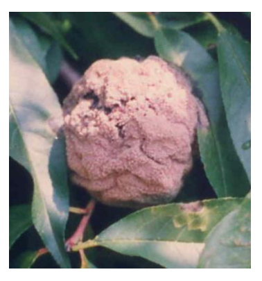
Figure 9 Brown rot on a peach fruit