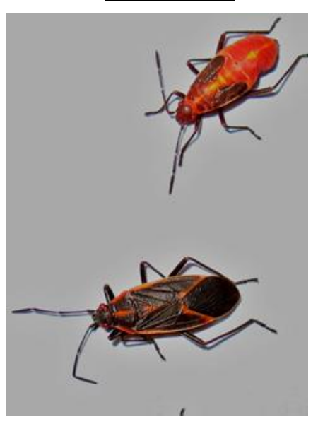
Figure 5 Boxelder bug nymph (above) and adult (below)

(Boisea trivittata) are usually the number one complaint for home invaders (although the brown marmorated stink bug, see article below, is vying for the title). The Plant Clinic has not yet received any reports of this nuisance pest, but it is almost certain to show up when the weather cools down. These insects feed on sap of seeds, flowers, and leaves of boxelders (Acer negundo). Their feeding causes little damage to the tree. They are considered to be a nuisance when large numbers of them appear in homes, especially in fall and spring. Nymphs are bright red when they first hatch, developing black wing pads over time. Adults are about 1/2 inch long, have three red or orange lines in back of their heads, and have black wings with red lines, and a red abdomen (fig. 5). Boxelder bugs overwinter as adults in protected sites. Since they consider your house to be a protected site, if you have cracks in your foundation or around your windows, they will enter your house through those cracks in fall. They do no harm in the house but are very annoying.