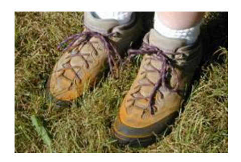
Figure 8 Shoes covered with orange rust spores

Management: There is no permanent shoe damage, and the orange spores can be easily wiped off. Lawn rust is usually not severe enough to warrant use of fungicides, and sound management practices will keep