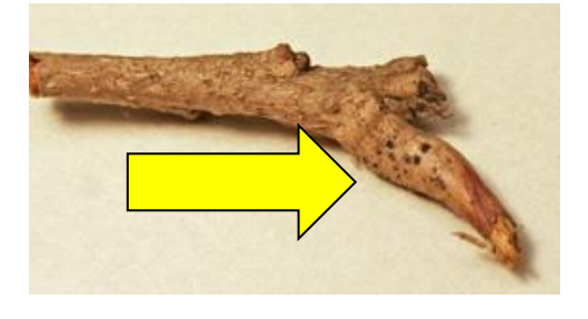
Figure 6 Black pustules on leaf stalk

Management: First, confirm that the tree actually has bur oak blight. Get a sample tested at the University of Illinois Plant Clinic (<u>http://web.extension.illinois.edu/plantclinic/</u>). Keep trees vigorous through proper watering and pruning (during dormant season). Iowa State and University of Minnesota are indicating that injections of