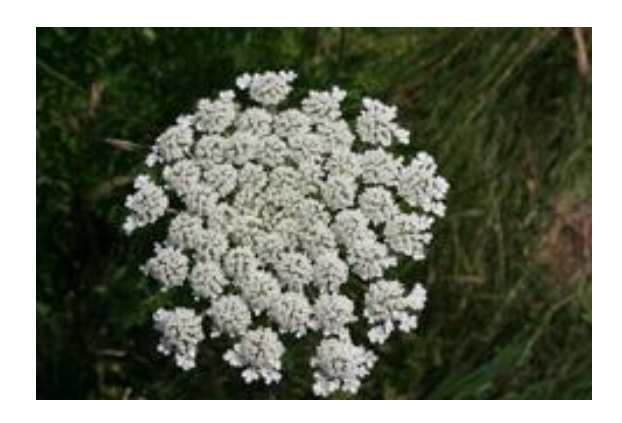
Figure 1 Queen Anne's lace