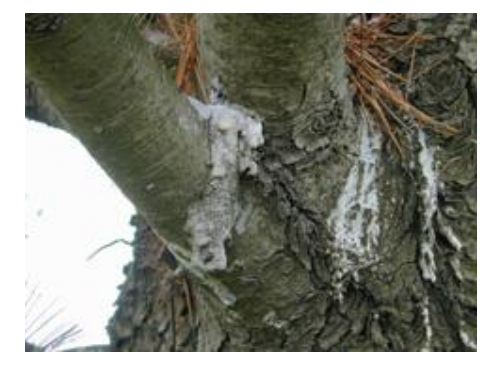
Figure 2 Pitch masses due to Zimmerman pine moth

Larvae overwinter in cocoon-like structures under bark scales. They become active in the spring and tunnel into the bark and sometimes the terminals. In late spring, they migrate to the base of branches, tunneling into the