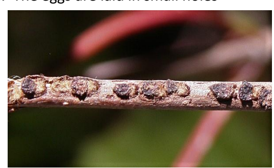
Figure 3 Egg-laying site

The Plant Clinic at The Morton Arboretum is getting numerous emails from homeowners with magnolia scale ( Neolecanium cornuparvum ) on their magnolia trees. This is an unusual scale