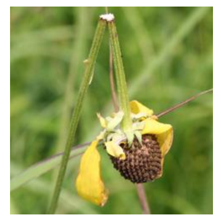
Figure 8 Flower damaged by the headclipping weevil

Once the flower head finally breaks off and falls to the ground, the larvae hatch and use the flower head for food. Mature larvae will move into the soil to overwinter, with pupation occurring in late spring.