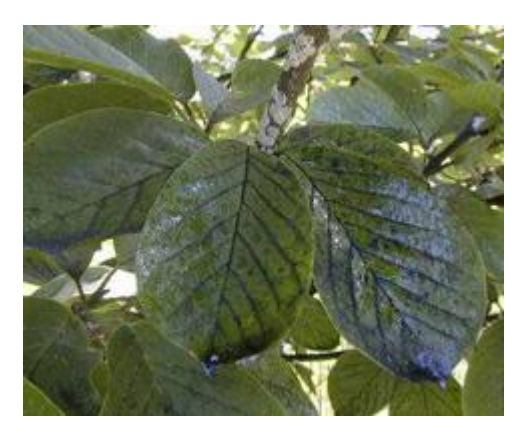
Figure 4 Sooty mold growing on honeydew excreted by magnolia scale

in northeastern Illinois. These insects have sucking mouthparts and extract sap from the host plant's branches and twigs. Badly infested branches and twigs are weakened and plant growth is slowed. When infestations are severe, branch dieback can result, and with repeated severe attacks, trees may be killed. As with most soft scale infestations, plant leaves are often covered with sooty mold (fig. 4), a black fungus that grows on the honeydew excreted by the scales. Sooty mold cuts down on photosynthesis because it blocks sunlight from the leaf.