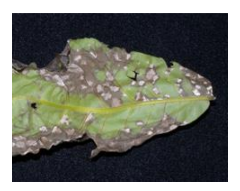
Figure 17 Downy leaf spot on underside of leaf

Downy leaf spot, also known as white mold or white leaf spot, caused by the fungus Microstroma juglandis , has been found on hickory ( Carya sp.). Powdery, white, fuzzy spots that are more concentrated near the leaf veins are forming on the underside (fig. 17) of the leaf surface. Corresponding chlorotic spots appear on the upper leaf surface. These spots vary in size and may coalesce to form large angular lesions. The fungus may also cause witches' brooms near the ends of branches with stunted and yellowish leaves that may drop in early summer.