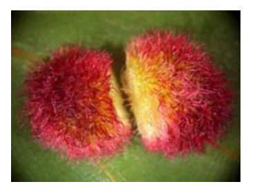
Figure 12 Hedgehog gall