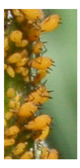
Figure 9 Yellow aphids

During this growing season we have had scattered reports about aphids on a variety of plants. Most of the populations have been small. Now as we get into late summer, we are getting a lot of reports of large populations of aphids on some of our native plants like common milkweed ( Asclepias syriaca ) and cup plant ( Silphium perfoliatum ). There are a number of different species of aphids that vary in color: yellow, green, pink, black. Right now, we are seeing a lot of the yellow and red species. The yellow ones ( Aphis nerii ) are called oleander aphids or milkweed aphids (fig. 9). The red ones (fig. 10) are most likely a species of Uroleucon , which feed on members of the Aster family (to which many of our late season natives belong). They are all tear-drop shaped and have two cornicles on the back end (looks like twin tailpipes). Aphids are small, about 1/16".