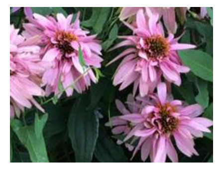
Figure 16 Eriophyid mite damage

There is also an eriophyid mite that can cause similar symptoms. Do we care about the cause of the damage? Yes. If it is aster yellows, you may have to dig up the plant and destroy it. If you can find the mites in the flower, then removing infested flowers or cutting the plant down to the ground in the fall and getting rid of the debris may be all that is needed. So how can we tell who is who? Ohio State reports that when aster yellows is the culprit, the distorted flower parts tend to be green (fig. 15) in color, but when mites are involved, the distorted flower parts maintain their normal color