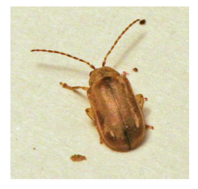
Figure 2 Adult viburnum leaf beetle