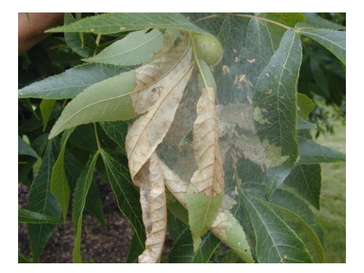
Figure 6 Fall webworm nest

Fall webworms overwinter in the pupal stage in the ground, under loose bark, and in leaf litter. Adult moths appear from late May through August, and females deposit eggs in hair-covered masses on the underside of host leaves. In about one week, eggs hatch into caterpillars that begin to spin a messy web (fig. 6) over the foliage on which they feed. The webs increase in size as caterpillars continue to feed. In about six weeks caterpillars will drop to the ground and pupate. Damage is generally aesthetic since this pest usually eats leaves late in the season, and webs are found in limited areas.