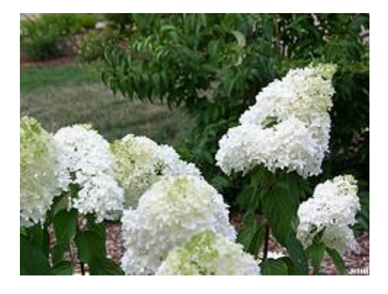
Figure 1 Panicled hydrangea