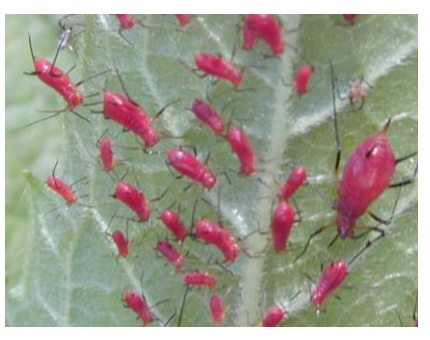
Figure 10 Red aphids