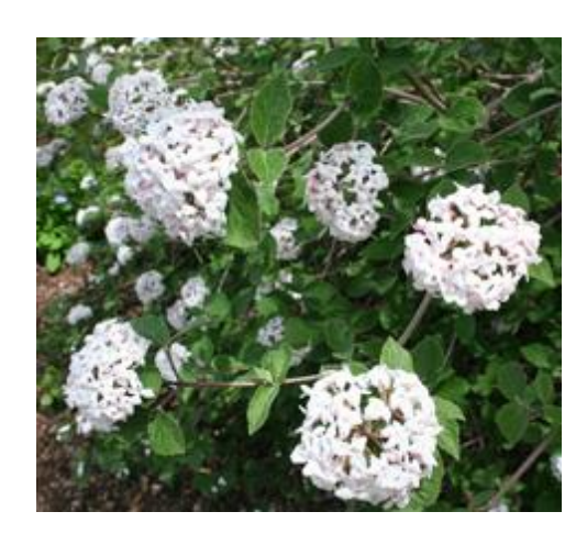
Figure 1 Korean spice viburnum in flower