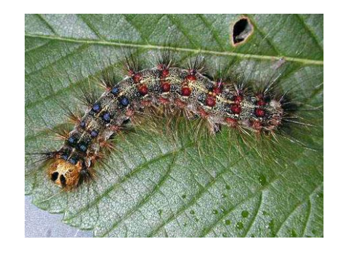
Figure 6 Mature gypsy moth caterpillar

Management: Bacillus thuringiensis var. kurstaki (Btk) can control young larvae but is not as effective against mature larvae. Treat while larvae are still relatively small. The first three instars remain in the tops of trees, so detection may be difficult. Mature larvae (fourth instar and later) feed at night and crawl down from tree tops to hide dur