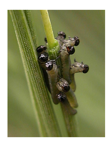
Figure 4 European pine sawfly

Another pest to expect around GDD 100-200 is the European pine sawfly ( Neodiprion sertifer ). When the larvae come out, they will be very small at first. Look at the ends of branches, as the eggs were laid in last year's needles. If you can't find any larvae, check the needles for unopened eggs. This insect can cause heavy defoliation on red, Scots, mugo, Japanese red, and jack pines. European pine sawflies are interesting to watch. Groups of sawfly larvae rear up their heads simultaneously when disturbed, making the group appear to be one much larger organism. This is a great defense mechanism. When fully grown, the sawflies will be about ¾ - 1 inch long and will have several light and dark green stripes on each side of their bodies (fig. 4). Their heads and the three pairs of legs are black. Their mouths are so small after hatching that they can