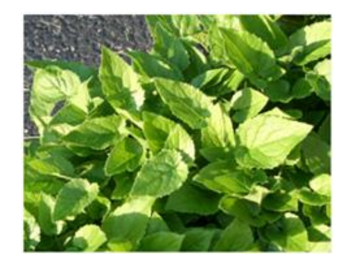
Figure 10 Leaves of creeping bellflower

For the last few years, we have been receiving reports of an annoying weed making itself known in flower gardens and lawns. Those complaints often come later in the season when this weed starts flowering, but we have already received two emails about creeping bellflowers