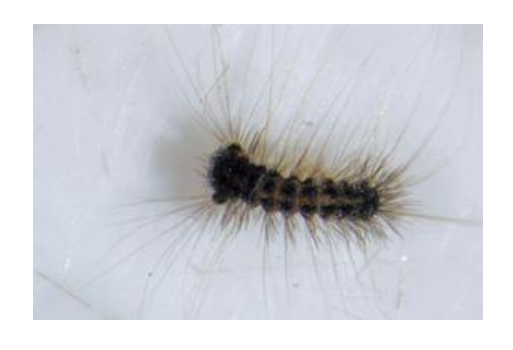
Figure 5 Early instar of gypsy moth caterpillar

Gypsy moth ( Lymantria dispar ) caterpillars are serious defoliators that feed on over 450 species of trees and shrubs. This is another pest that comes out at GDD 100-200. We have not found them yet this year, but it is wise to be scouting and catch them early as Gypsy moth populations have been rising in the last couple of years. Note that very early instar caterpillars (fig. 5) will not look the same as older caterpillars. As the caterpillars mature, they will develop 5 pairs of blue bumps, followed by 6 pairs of red bumps (fig. 6). Their favorite trees are oak, crabapple,