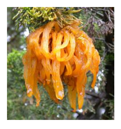
Figure 7 Cedar rust gall with spore horns expanded

We have received photographic evidence in our Plant Clinic email this week to show that the cedar rust galls are producing their telial spore horns and producing spores. I went to my back window to check my neighbor's poor juniper. On Tuesday morning, I could not see any spore horns, but by Wednesday noon, I did not need the binoculars to confirm the horns are expanded. They are fully expanded due to the rain this week (fig. 7). All three cedar rusts (cedar-apple, cedar-hawthorn and cedar quince) are active now. If you have not started protective sprays on the deciduous host, it is time to get going!