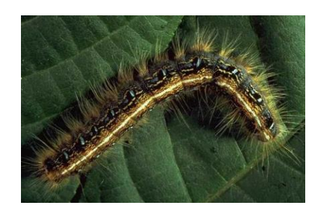
Figure 3 Eastern tent caterpillar

http://www.mortonarb.org/trees-plants/tree-and-plant-advice/help-pests/tent-or-web-making-caterpillars