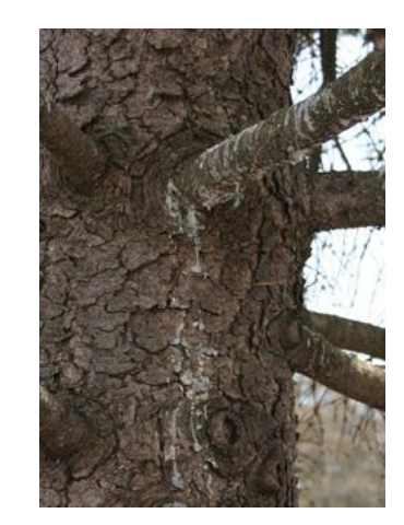
Figure 8 Sap flow from cytospora canker

Management: Cytospora canker is a stress-related disease, so, at minimum, trees should be kept mulched and watered well during dry periods. Remove infected branches promptly during dry weather to reduce the spread of the disease. It is imperative to disinfect pruning tools between cuts. Give spruces adequate space when planting as dense planting is another common predisposing stress factor. If it is necessary to remove trees, it would be wise to consider diversifying the planting, rather than replanting with a lot of spruces. Having a lot of the same plant in the landscape can magnify a disease problem. There is no effective chemical control.